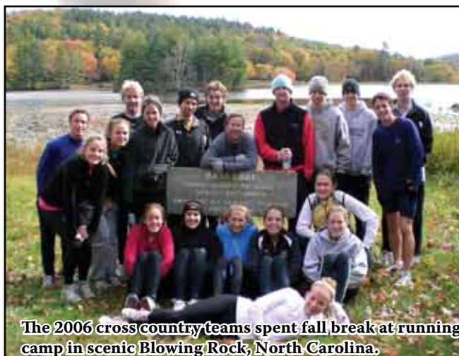
The 2006 cross country teams spent fall break at running camp in scenic Blowing Rock, North Carolina.

Other Notes: Finished in VU top 3 at every meet in 2006...2006 SEC Athlete of the Week... PRs include 25:26 (8k), 32:26 (10k), and 15:05 (5k)