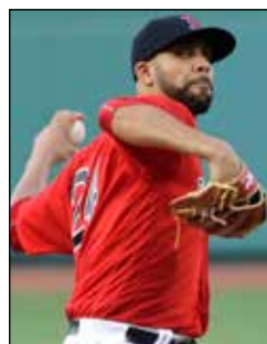
Red Sox David Price is one of the game's most dominating pitchers.

Illustrated's Lee Jenkins is regarded among the nation's most knowledgeable NBA writers; Buster Olney is ESPN's top baseball analyst; and Skip Bayless is in his second year co-hosting FOX Sports' Undisputed show.