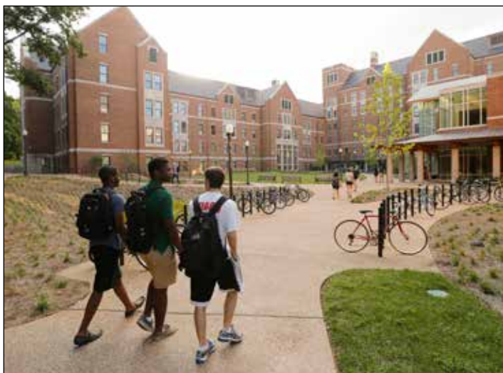
Warren and Moore college halls opened in 2015 on the main campus, adding to Vanderbilt's reputation for unique, on-campus living experiences for its students.

The residential communities have hosted Vanderbilt athletic activities. The Ingram Commons was showcased in October 2008 when ESPN selected the site as its location for the popular College Football GameDay broadcast prior to airing Vanderbilt's victory over Auburn on campus.