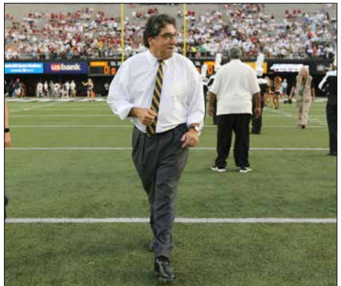
The chancellor prepares to lead Vanderbilt freshmen on their annual Anchor Dash. The class makes its entrance for the opener by running the stadium playing surface.