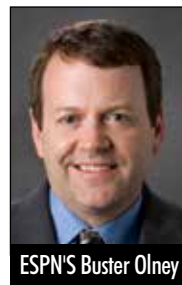
ESPN's Buster Olney

Illustrated's Lee Jenkins is regarded among the nation's most knowledgeable NBA writers; Buster Olney is ESPN's top baseball analyst; and Skip Bayless is in his second year co-hosting FOX Sports' Undisputed show.