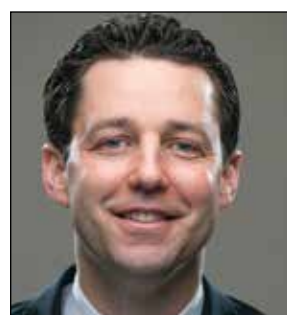
BRYCE DREW Men's Basketball